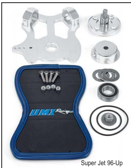
Super Jet 96-Up