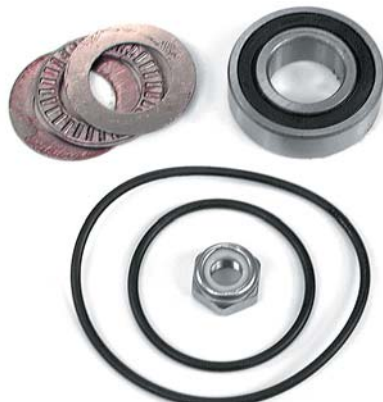
Super Jet Rebuild Kit