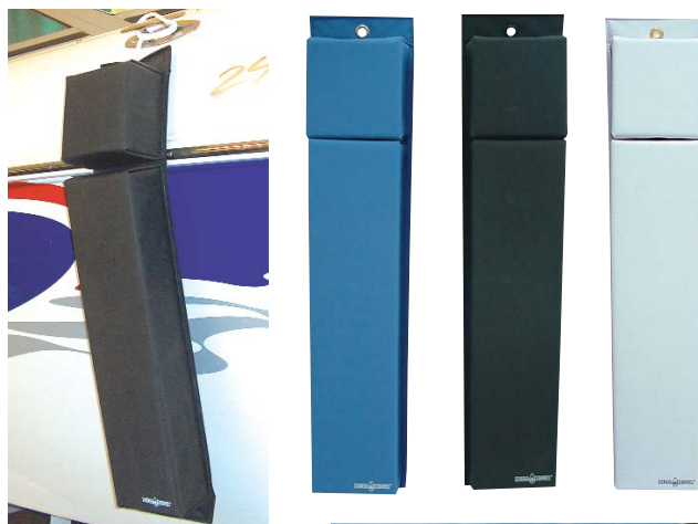
XL Contour Fender